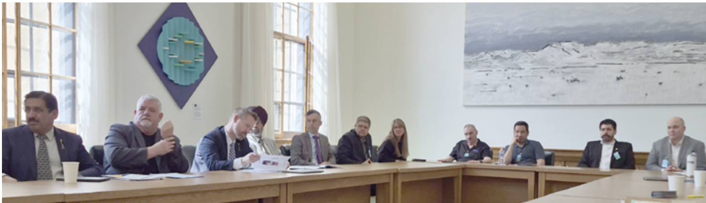
TOP: UFCW members headed to the Regina Legislature for Lobby Day — read the story on page 6 for more details.