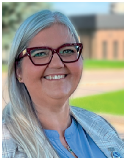
President, UFCW 1400

In times like these, it's easy to feel weighed down.