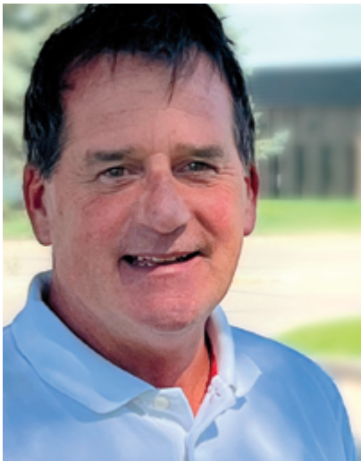
Director of Negotiations

This is what we've been busy with since January: