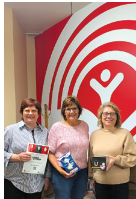
Participants at the UFCW 1400 Women's Conference made donations of products to Period Promise, a United Way and labour initiative that aims to provide products to those who need them.

The Women's Committee is always looking for fresh perspectives. Reach out to your representative to see how you can get involved in the next chapter of our story!