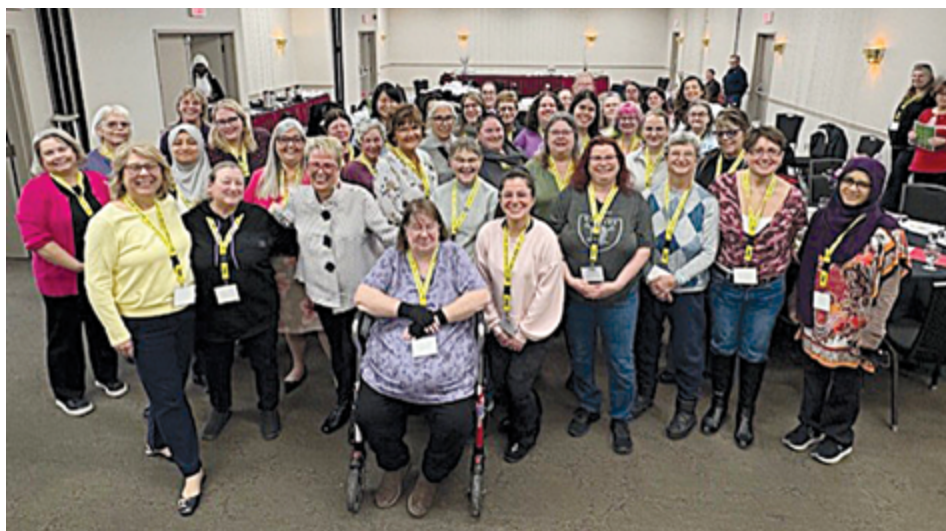
Participants at the 20th-annual UFCW 1400 Women's Conference had the opportunity to share experiences and find inspiration and knowledge over this impactful two-day conference.